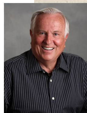
Josh McDowell Josh McDowell Ministry