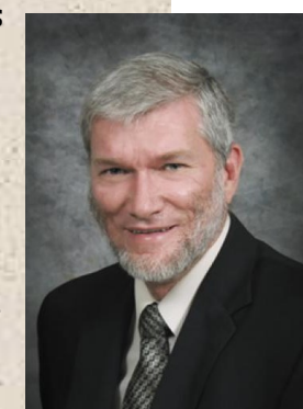
Ken Ham President, Answers in

The ABR team is extremely excited about our new DVD series, improved and expanded Bible and Spade magazine, and our soon to be announced series of ABR-produced booklets. We are on the move to share the tremendous research and evidences that will encourage and inform the body of Christ and the world of scholarship. A key piece in this effort, is our ongoing development work in creating an archaeological curriculum. Designed for multi-faceted use, the curriculum will include games, video segments, and powerful lessons that will guide students in seeing how biblical archaeology affirms the reliability and authority of the Bible!